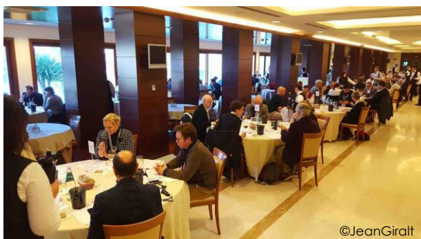
The International Grenaches du Monde

Download the complete list of award winners at www.grenachesdumonde.com